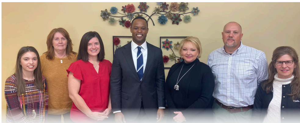
Attorney General Daniel Cameron toured PHC on February 2

In a much-anticipated decision, the Kentucky Supreme Court ruled on February 16 that a lower court wrongfully stopped the enforcement of the state's two laws that protect the unborn. This decision allows for abortion to remain illegal in Kentucky, resulting in between 2000-3000 abortions that would have typically occurred to no longer be happening in the state.