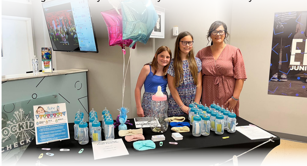
Church on the Rock members showcase their Baby Bottle display

Don't forget to return your bottle to your church or directly to PHC.