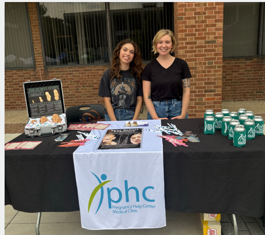
PHC was represented at City Fest at ECU on Sept. 12.